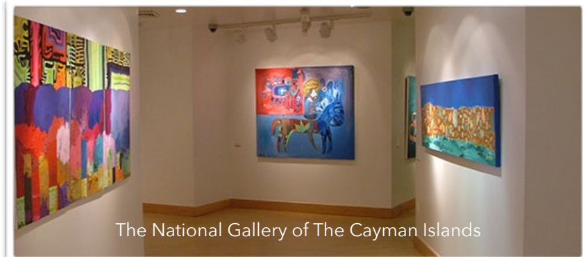
The National Gallery of The Cayman Islands

(Look for this free download in your app store)