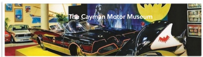
The Cayman Motor Museum

We hope you take time to explore some of what is listed here. To learn more, simply click on any of the items listed on the following page.